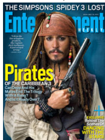
May 18, 2007 Issue Male Index 124, Female Index 135